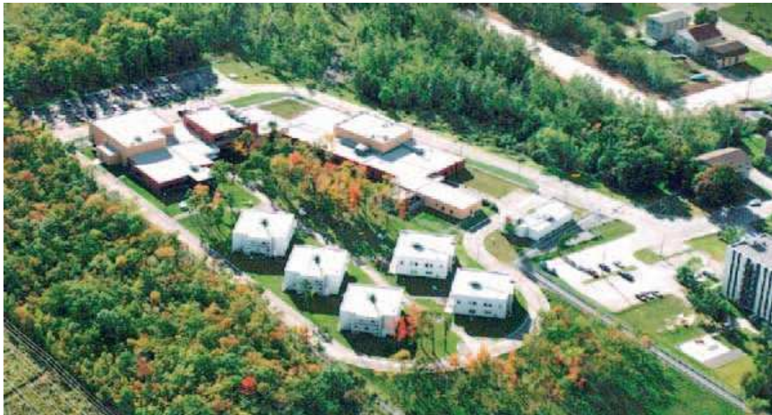
Above: Joliette Institution

The new arrangements for women prisoners in the CSC were based on the thinking in the report of the task force. Ten years after the last of the five units was opened one can assess some of the outcomes.