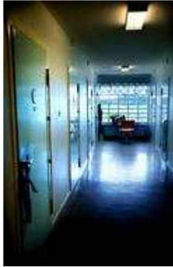
Above: Inside Hinseberg women's prison

in conjunction with the National Prison and Probation Service whether or not the child may stay in prison. Things are arranged in a way that provides the best possible situation for the child. Hinseberg, a large closed prison solely for women, has an equipped flat with a small garden where children can have overnight visits.