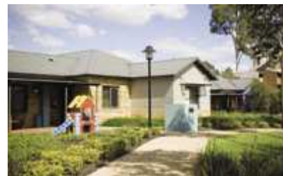
Above: Family residence for mothers with children living with them or staying for an extended period

The key steps towards appropriate women's imprisonment were, according to the inspector: