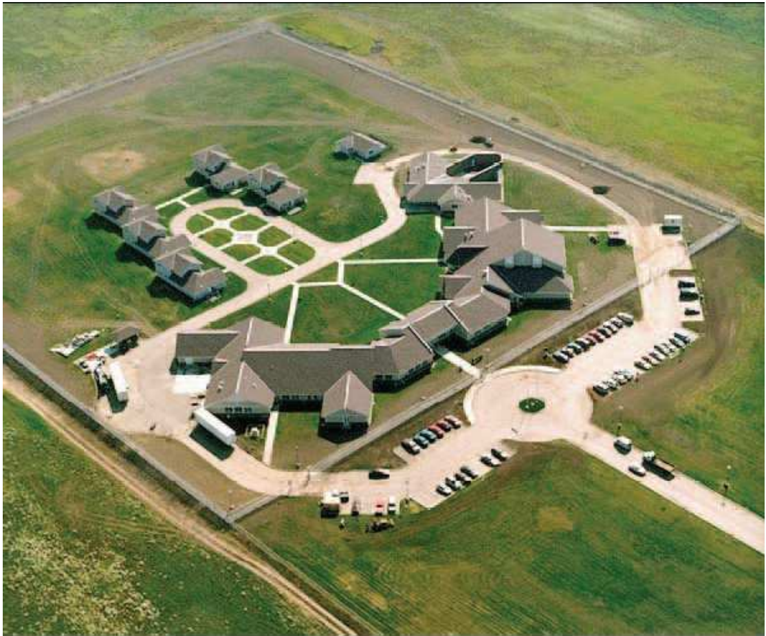
Above: Edmonton Institution for Women