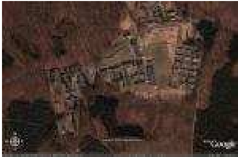
Above: Horseroed prison

attacked with a bread knife. There are some racial tensions in the prison. In harassment cases the harasser would be moved to a closed prison.