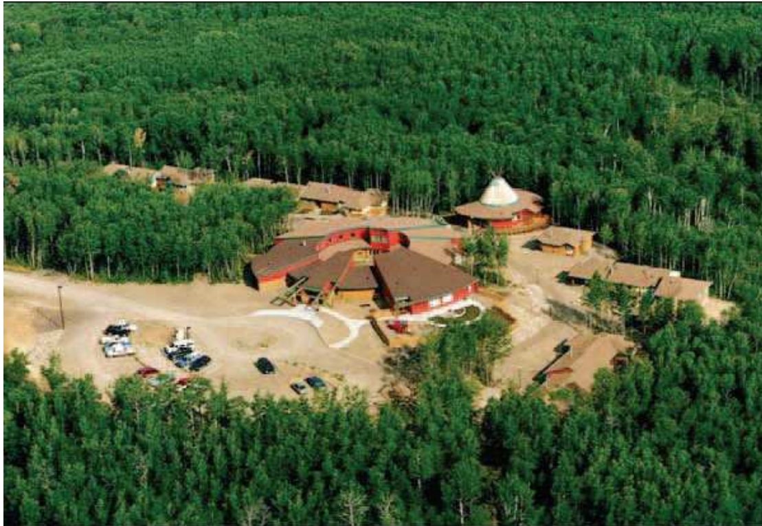
Above: Okimaw Ohci Healing Lodge