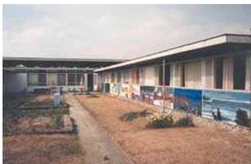
Above: Ringe prison

The decision about whether to have children living in prison with their mother is not made by the prison; if the local authorities say that the mother is fit to look after her child then it is the mother's decision whether to have her child with her or not. All efforts are made to ensure mother and children are not separated when the child reaches her/his third birthday. There is a halfway house in Copenhagen and if possible, depending on the length of sentence, a mother and her child can be transferred there.