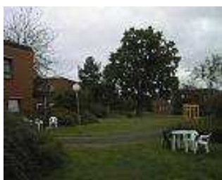
Above :The grounds of the women’s prison in Bremen

Each floor also had pay-laundering facilities, a recreation room with a television, and a gym room, regrettably without much working equipment. A piano room was located in the adjoining building next to the visits rooms. A very fine garden had been laid out in the grounds, but offered no shelter from inclement weather. 74