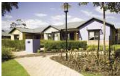
Above: Residences at Boronia

Part of the reform programme was the opening of the Boronia Pre-release Centre with 70 places in May 2004. The Inspector of Custodial Services set out a blueprint for women's imprisonment which has been incorporated into the design and structure of the Boronia centre. 10