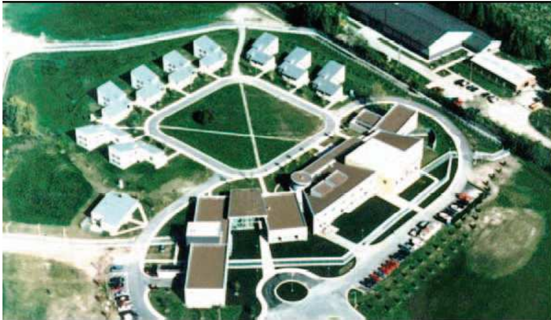
Above: Grand Valley Institution for Women