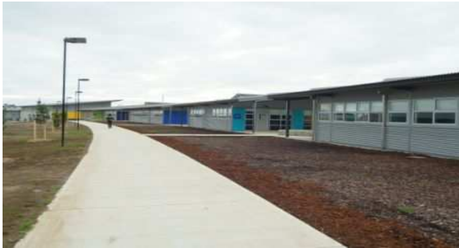
Above: Auckland Region Women's Corrections Facility

The Auckland Region Women's Corrections Facility, which opened in August 2006, is New Zealand's newest and first purpose-built women's prison and holds 286 prisoners. The Department of Corrections claims that the building 'provides prisoners with as normal an environment as is possible in a prison,' The prison can employ 'up to 115 prisoners at any one time in textiles, catering, laundry, ground maintenance, and release to work programmes.' The prison also has self-care units on the Canadian model with groups of prisoners living together in four bedroom houses. The self-care units also provide for some mothers with their babies.