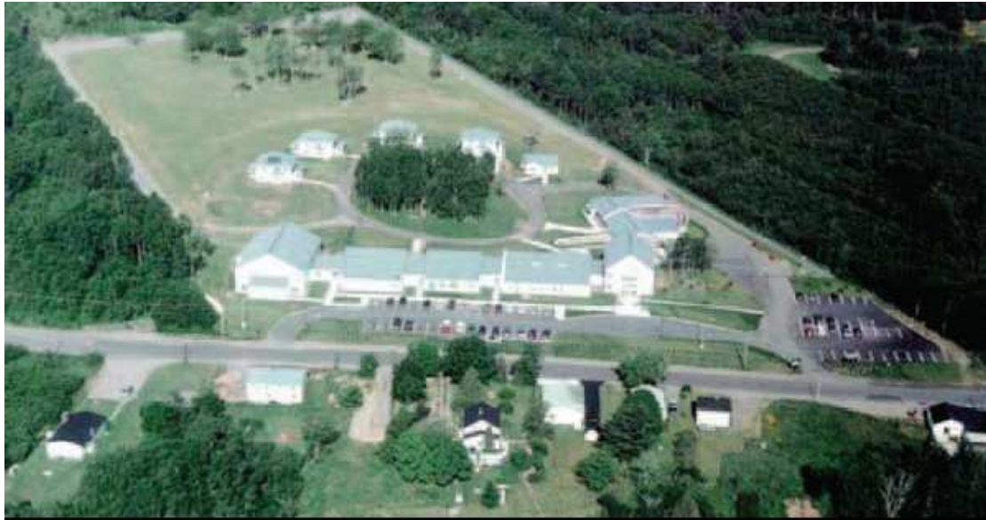
Above: The Nova Institution for Women

The need to introduce radical changes in the treatment of women prisoners was reinforced by a much-publicised incident in 1995 when the videotape of an all-male emergency response team strip-searching women prisoners was made available to the Canadian Broadcasting Corporation. This incident and the events which preceded it led to an inquiry by Justice Louise Arbour whose report 25 found a considerable level of abuse and failure by the prison staff to observe the law and regulations. Seven years later a report by the Canadian Human Rights Commission found that women in federal prisons were still experiencing discrimination on the basis of gender, race and mental or physical disability. 26 The report noted in particular the discriminatory effect of male-based security classification tools, lack of appropriate counselling, limited employment training opportunities and inadequate complaints mechanisms to deal with harassment.