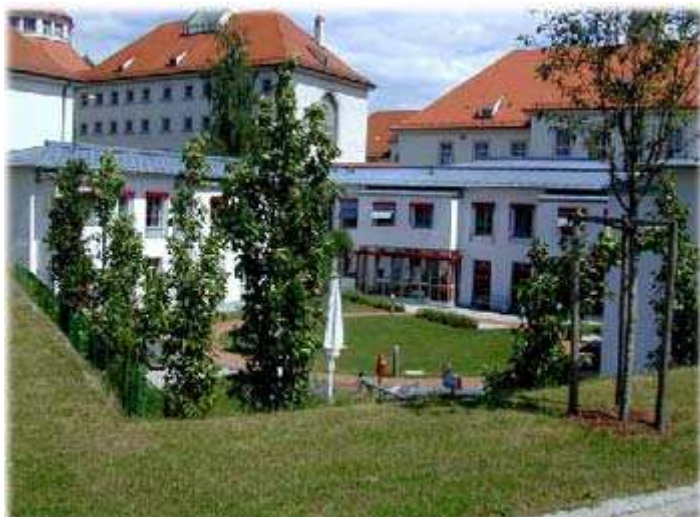
Above – The mother and child unit at Aichach prison in Bavaria

Prisoners who are not at risk of absconding or committing further crimes are granted leave and relaxation of certain conditions to help prepare them for reintegration on release. Prisoners have twenty one days of leave per year and extra leave may be granted for special reasons including family events. Prisoners from the open prison in Freistaat Thüringen can go out to visit family at weekends.