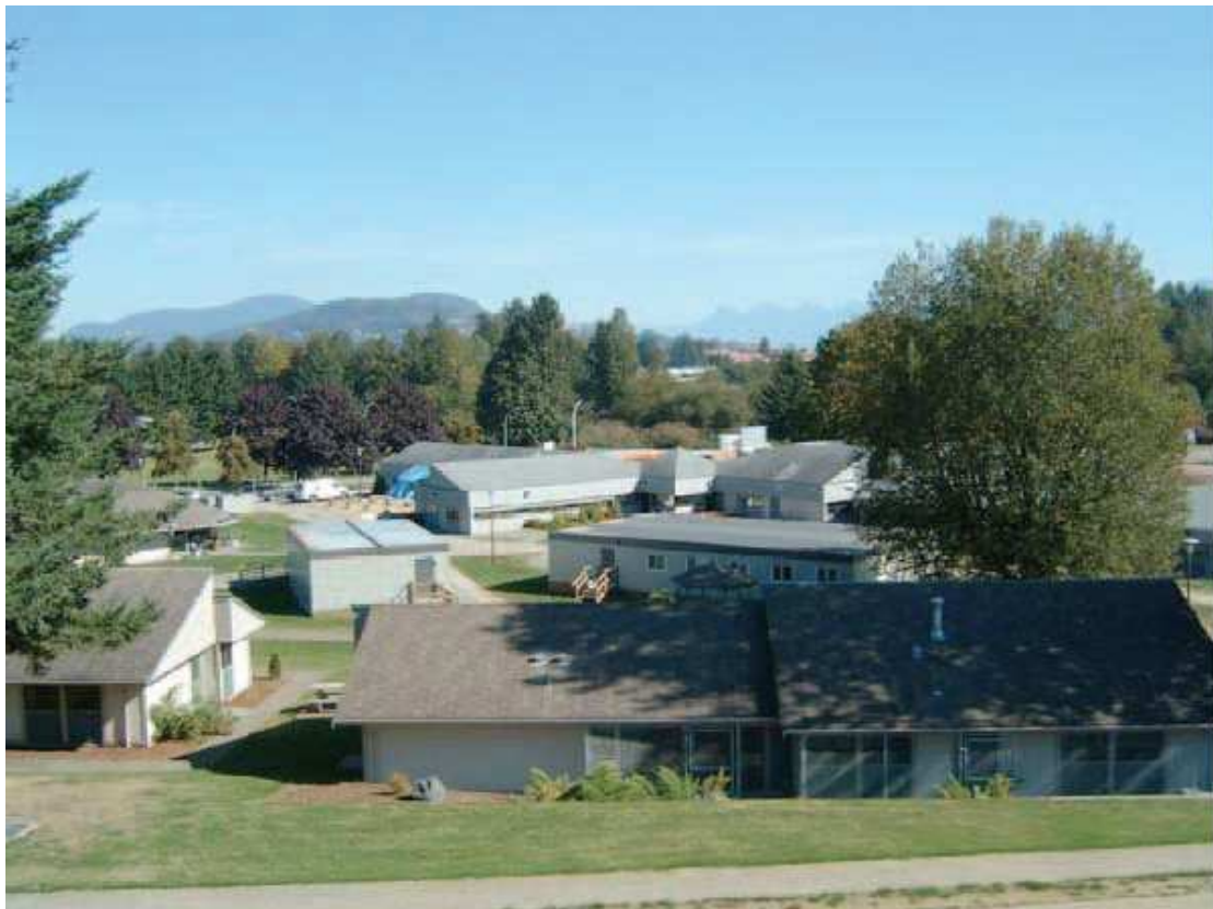
Above: Fraser Valley Institution

That would indeed appear to be the case.